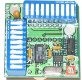
AM1000F Agile module