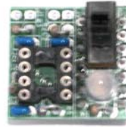
AM1000T Set Power Module

Available options: (AM1000BR Mount Bracket not pictured)